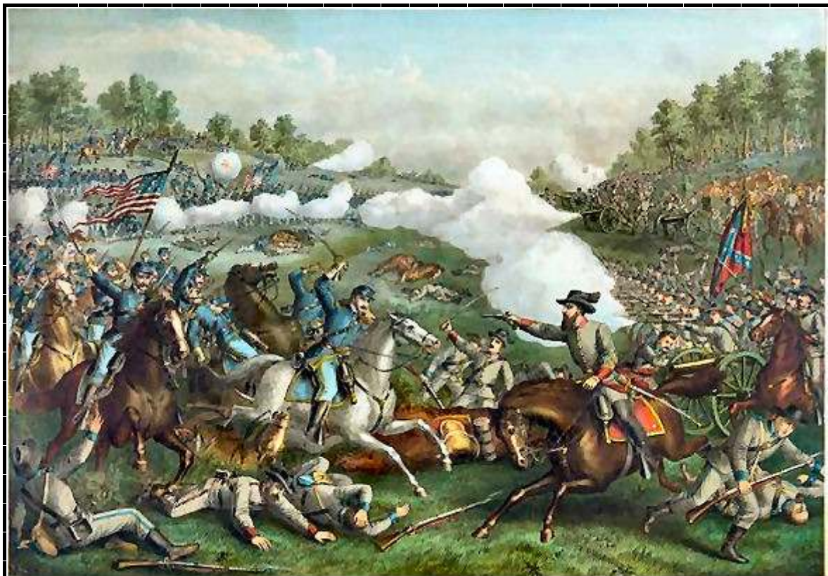
Battle of Opequan or Winchester, VA