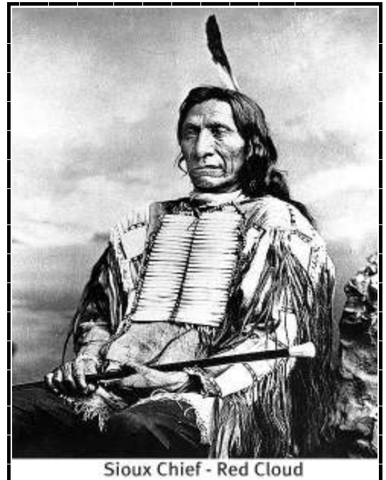
Sioux Chief - Red Cloud

The soldiers were ferried across the Missouri river to Omaha, Nebraska, where they took the long overland trail to their objective at Cheyenne, WY. At that time the Sioux