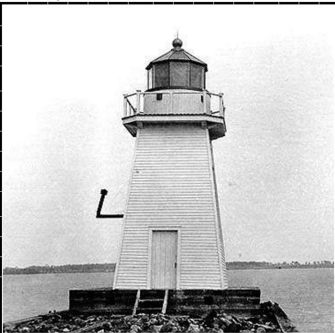
Lighthouse beacon in Plattsburgh Harbor