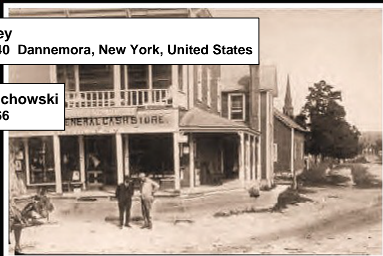
Cadyville in the early 1900s